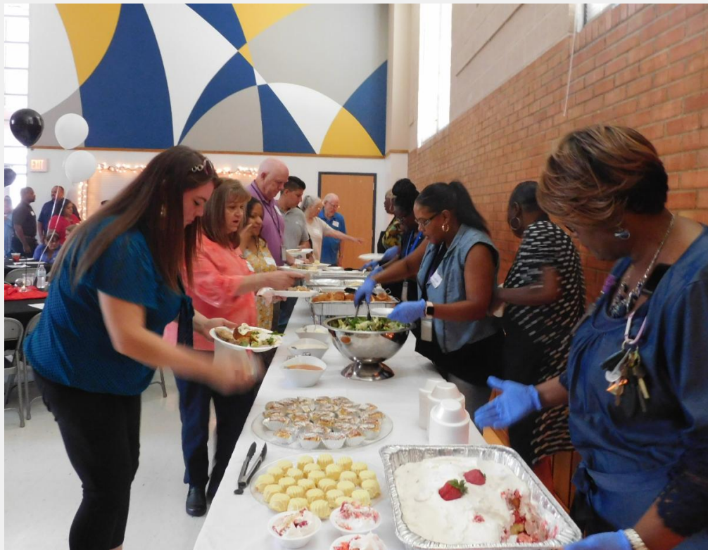
Fort Worth Housing Solutions hosted a Landlord Appreciation Luncheon recently.

Fort Worth Housing Solutions would like to recruit more landlords to partner with us in the Housing Choice Voucher (HCV) program. Participating landlords benefit from guaranteed rent, deposited directly into a bank account. The agency conducts criminal history background checks